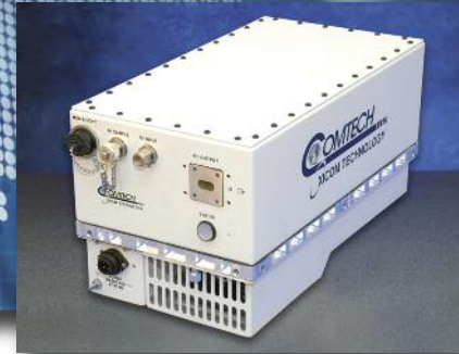
400 Watt High-Efficiency, Ku-Band, Antenna-Mount TWTA

Comtech Xicom Technology's line of HPAs (High Power Amplifiers) are designed to cover your mobile satellite news gathering (SNG) requirements.