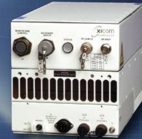
60 Watt Ku-Band Antenna-Mount SSPA