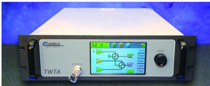
New LCD Touch Screen Control