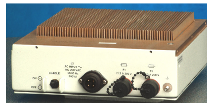
Field Replaceable Power Supply

Mounting brackets are supplied to mount the high power amplifier to most popular antennas.